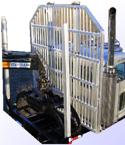
Patented All Aluminum Headboard