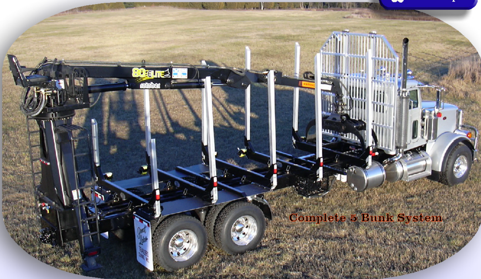
Complete 5 Bunk System

Our Patented Gusseted Steel Bunks, GLT Alum-A-Log Stakes and all Aluminum Head Board create a durable, lightweight system that can carry a larger payload.