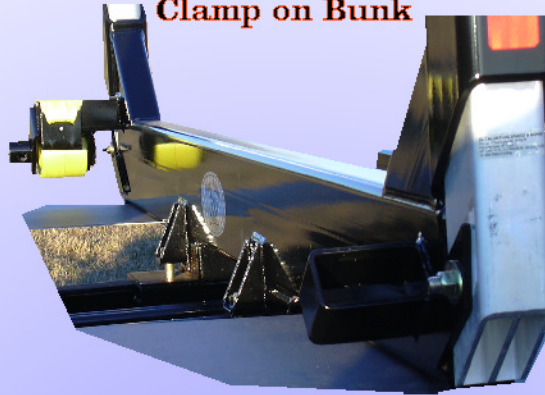
Patented Raised Gusseted Clamp on Bunk