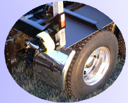
Stainless Steel Quarter Fender