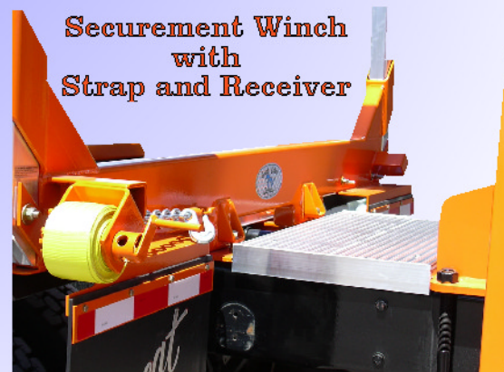
Optional Lightweight Aluminum or Steel Frame Covers