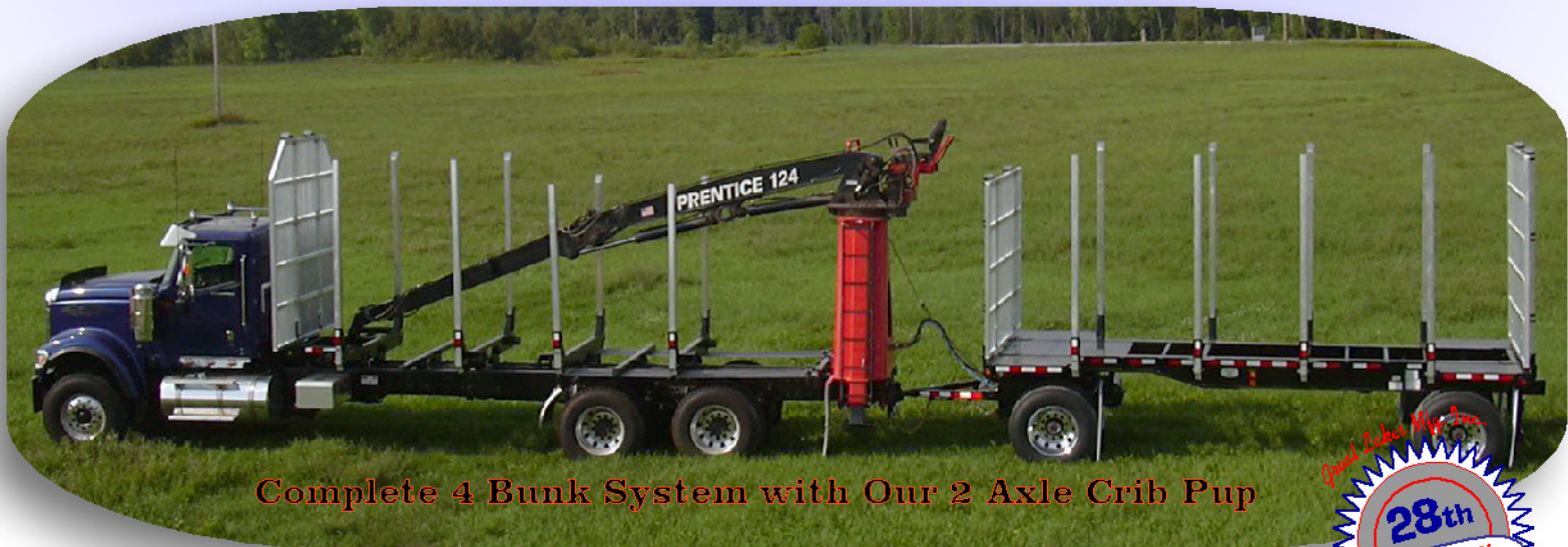
Complete 4 Bunk System with Our 2 Axle Crib Pup

Our Patented Gusseted Steel Bunks, GLT Alum-A-Log Stakes and all Aluminum Head Board create a durable, lightweight system that can carry a larger payload.