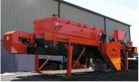
40" Mill, Electric Powered, Stationary, Conveyor Drop

Diesel, Electric, PTO! Portable or Stationary! Conveyor Drop or With a Blower!