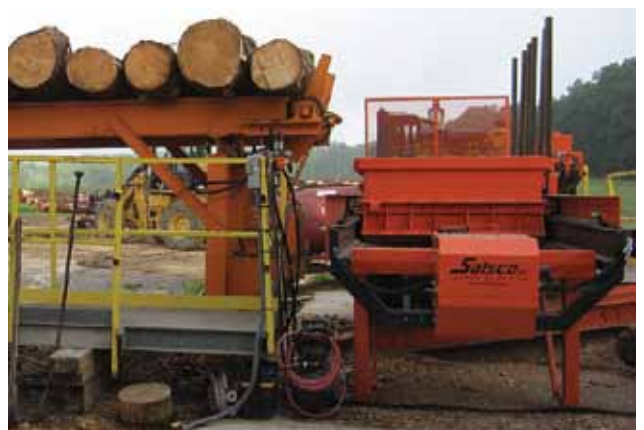
60" Mill, Stationary, 200HP Caterpillar Diesel Engine, Conveyor Drop