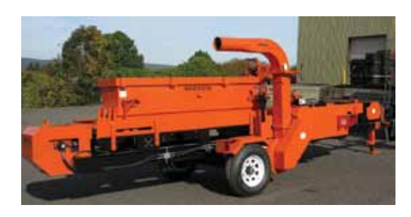
Pictured above-20" Mill, PTO Driven, Portable with a Blower.

ALL ADJUSTING SHAFTS HAVE PUSHER SCREWS TO KEEP SHAFTS ALIGNED!