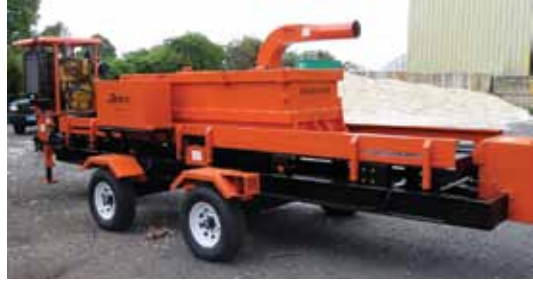
30" Mill, Portable, 91HP Caterpillar Diesel Engine, with Blower

Diesel, Electric, PTO! Portable or Stationary! Conveyor Drop or With a Blower!