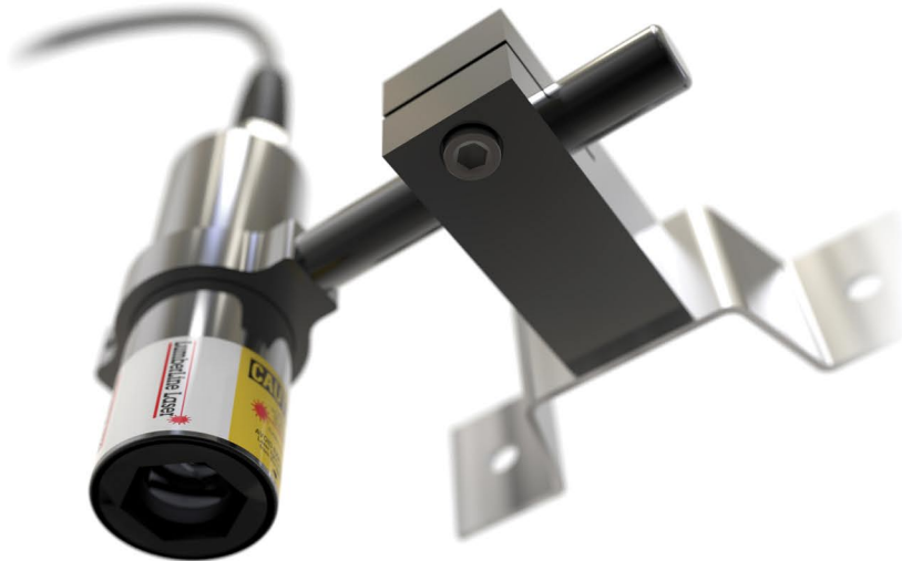
*Shown with optional SA-008 stationary bracket

If you will be connecting to a 3-9vdc source providing your own power to the unit, it can optionally be ordered with an industry standard M12 connector. Just spec M12 after your required model number when ordering. We carry 2m and 5m cordsets if required.