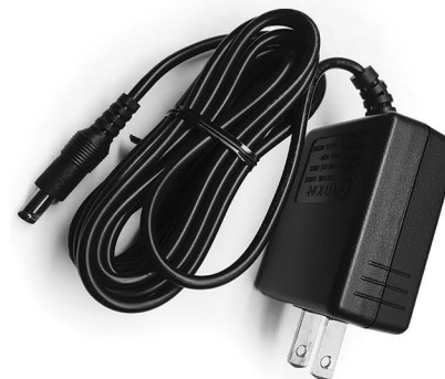
SA-115 PSU (STANDARD)

GREEN L-05-R-GRN L-10-R-GRN L-20-R-GRN L-30-R-GRN