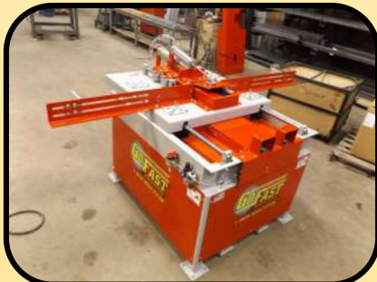
TABLE MOVES W/ DUAL AIR RAMS AND LINEAR BEARINGS