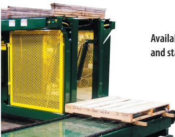
Available with optional incline belt and stacker take-away (shown).